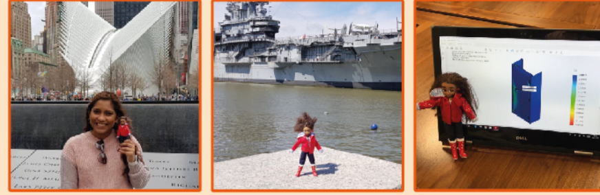
Design Engineer, Techwuman Melissa Ahmed

I take a drawing of something and then make it in real life by cutting, bending, and assembling raw materials like metal, then fusing these raw materials together using heat. Fabrication and welding are used to make cars, buildings, paperclips and lots of other things.